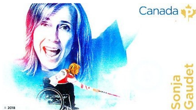
Figure 3 A recent Canada Post release in a peel and stick booklet.

We seem to be hitting the prime stamp show season. There are several opportunities to travel, and with the cooperation of the weather, a chance to see what stock other dealers have that may look good in a personal collection. Please note that a very nearby stamp club is having a show on May 5 th in Hanover. It would be good to see a really strong turnout to support this club as well. By May the weather should not be a concern, unless the garden poses a distraction. There is also an early heads up for the Royal in June in St. Catharines